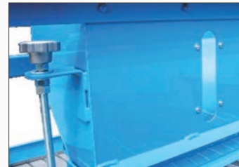
Adjustable flow feeder with window