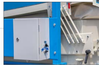
Variable frequency drive panel