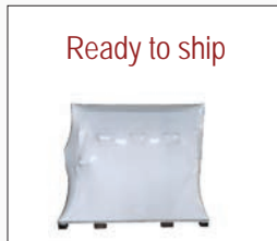
Ready to ship