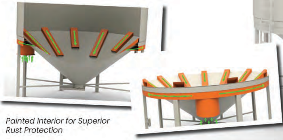
Painted Interior for Superior Rust Protection