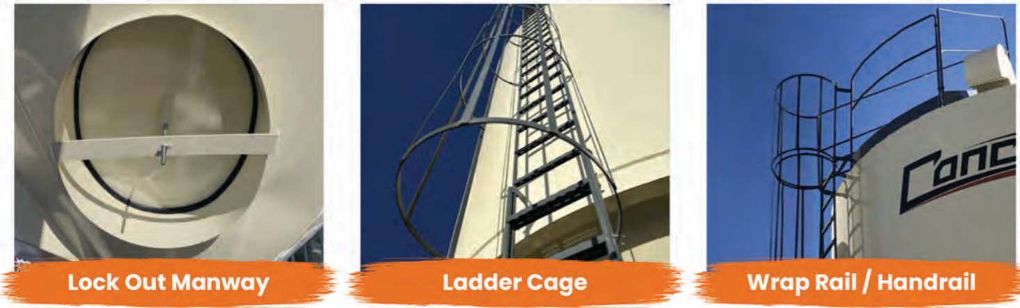
Lock Out Manway

Our bins boast the widest skid base on the market, include anti-slip ladder rung wraps, and are constructed to exceed industry standards. Other safety options include: