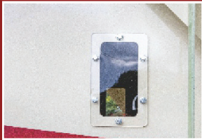
AIR CHAMBER WINDOW