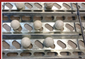
BALL TRAY SYSTEM