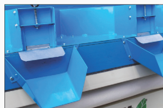
Spring loaded discharge gates