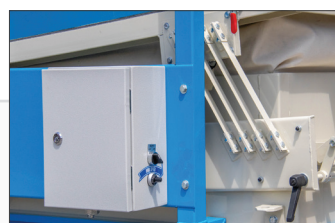
Variable frequency drive Panel