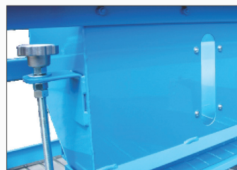
Adjustable flow Feeder with window