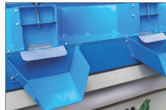
Spring loaded discharge gates