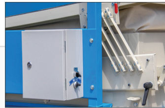
Variable frequency drive Panel