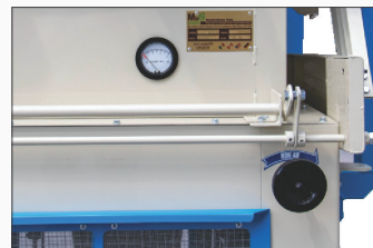
Air gauge & Air flow adjustment wheel