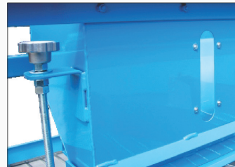
Adjustable flow Feeder with window