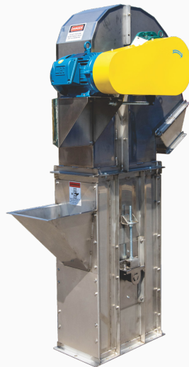
Elevator in Stainless Steel