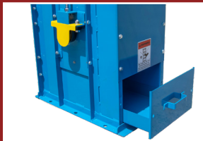
EASY BOOT CLEAN OUT